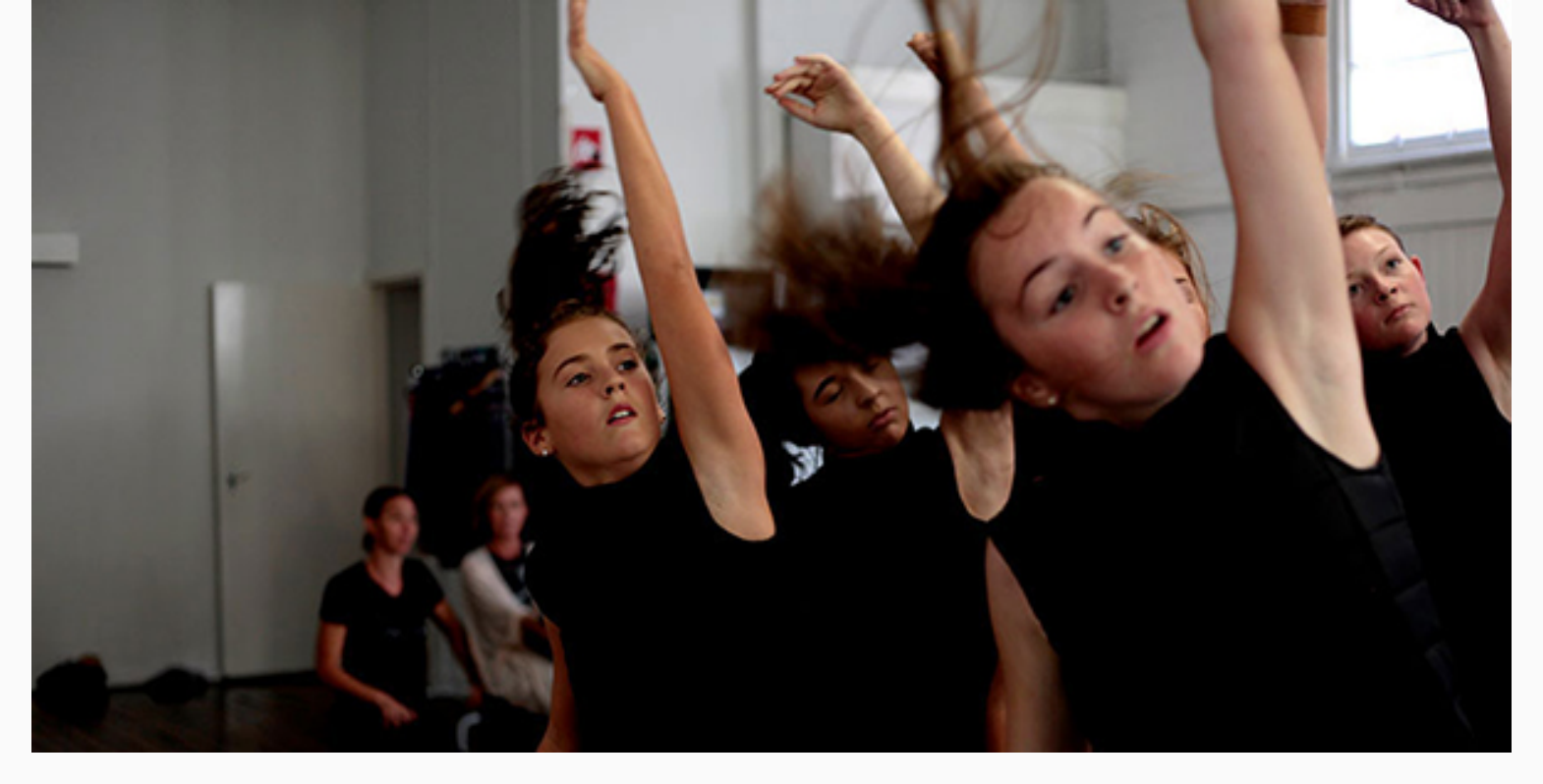
Flipsiders will be heading down to Canberra these School Holidays to take part in QL2's Meet Up Festival in Canberra, where they will be performing and taking part in workshops with other youth dance companies from across Australia and special guests The National Youth Dance Company of Scotland. All dancers will spend three days taking part in workshops in dance styles from around the world, in a friendly non-competitive learning environment. What a great opportunity!