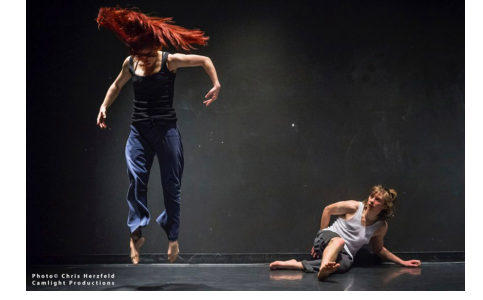
Propel Choreographic & Multi-Disciplinary Collaboration