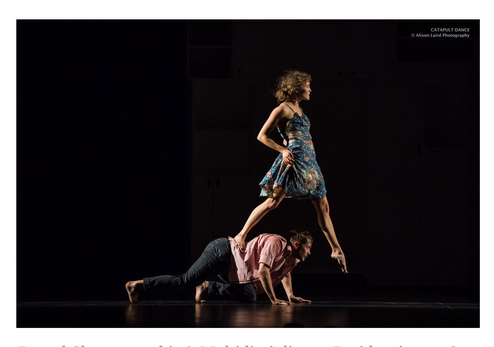
Propel Choreographic & Multidisciplinary Residencies 2018